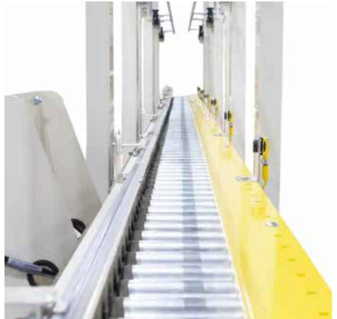
Narrow Flat Motor Driven Roller (FMDR) with discharge switch

The dual tier construction allowed for more accumulation in a smaller footprint. The narrow conveyor lane was designed to allow the products to be transported in an upright position minimizing space required for overall assembly line. In addition, a manual actuated discharge switch was installed to assist the operator in safely removing the products.